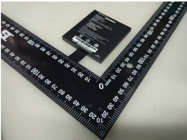
电池/ Battery(J295 3,8V 4300mAh)