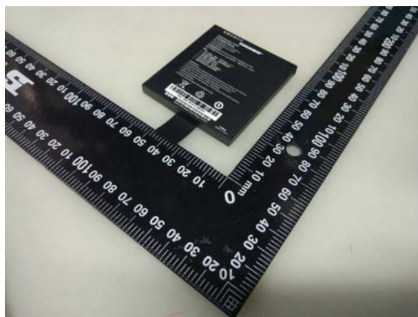
Battery/电池 J295 3.8V 4300mAh